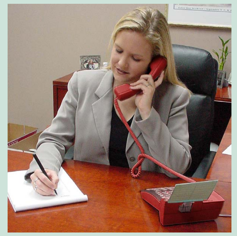
Through a toll-free Employment Practices Law Hotline, members can be in direct contact with an attorney specializing in employment-related issues. When faced with a potential employment situation, the hotline provides a no-cost, 30 minute consultation.